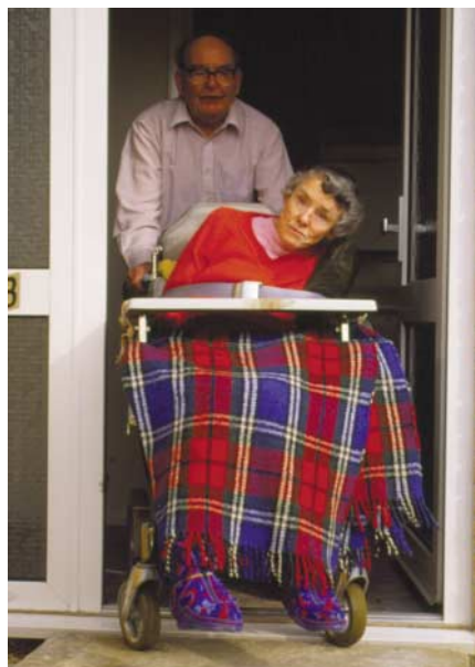
Lithium could help prevent the cell loss that impairs the movement of Huntington's sufferers.